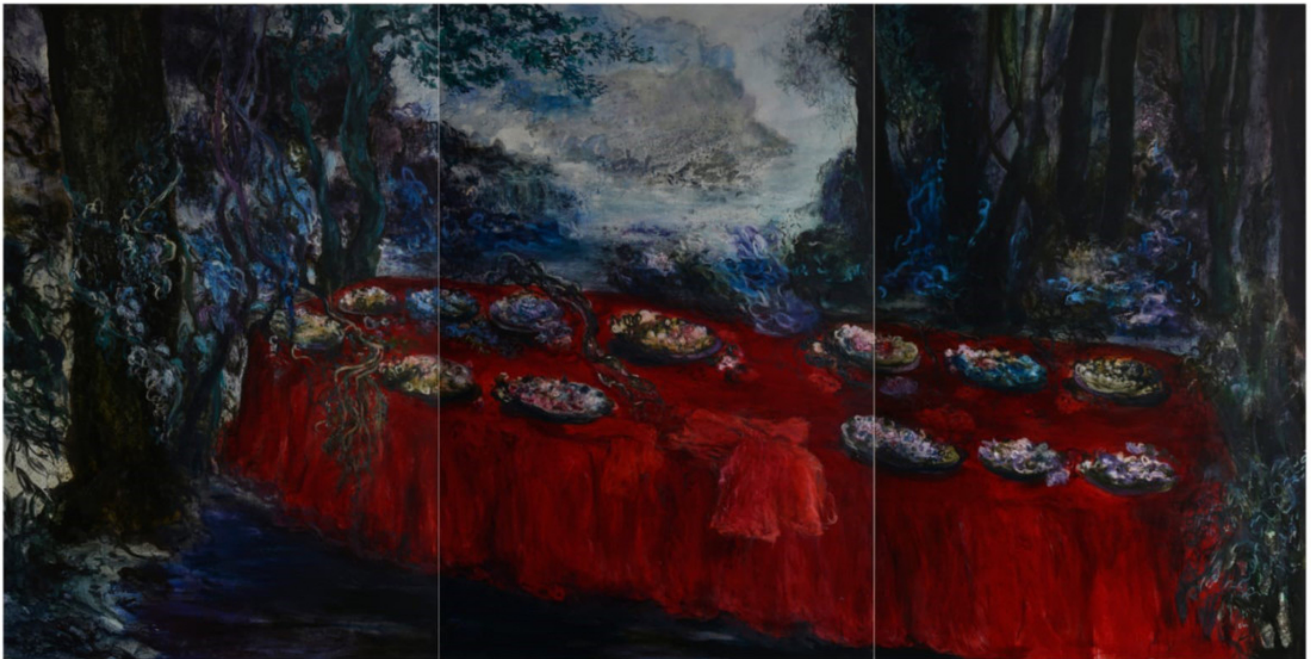
العشاء الأخير، ٢٠١٧ زيت على قماش ثلاثية، ١٩٥ × ٣٩٠ سم